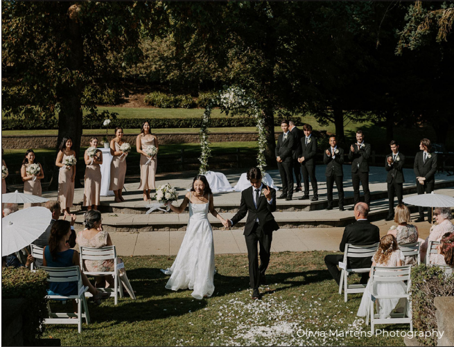
Olivia Martens Photography